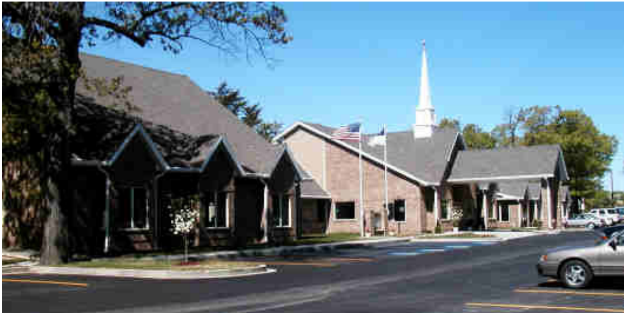
Overlooking the Lake of the Ozarks