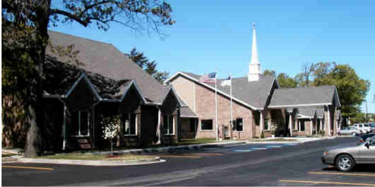
Overlooking the Lake of the Ozarks