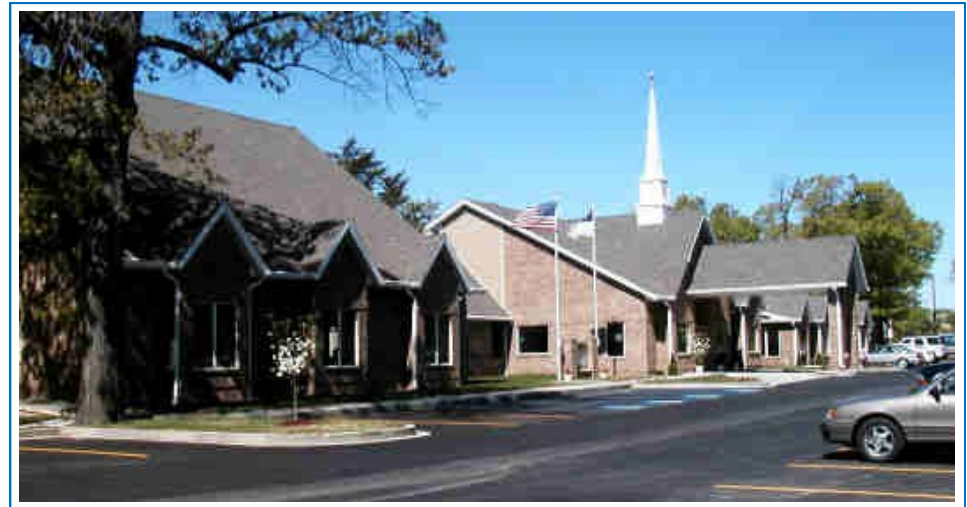
Overlooking the Lake of the Ozarks